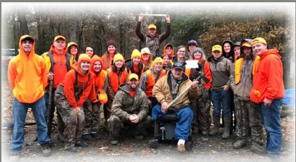
Sesser-Valier Outdoorsmen Club -Rend Lake 2020 EiP Winner

“The views, opinions and findings contained in this report are those of the authors(s) and should not be construed as an official Department of the Army position, policy or decision, unless so designated by other official documentation.”