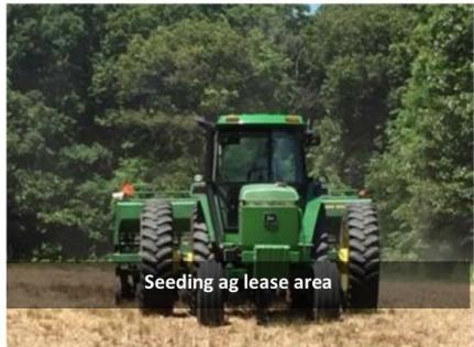
Seeding ag lease area