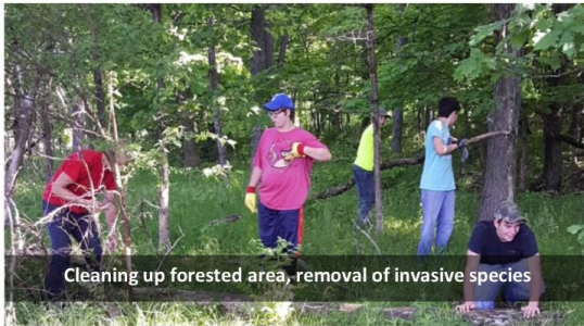
Cleaning up forested area, removal of invasive species