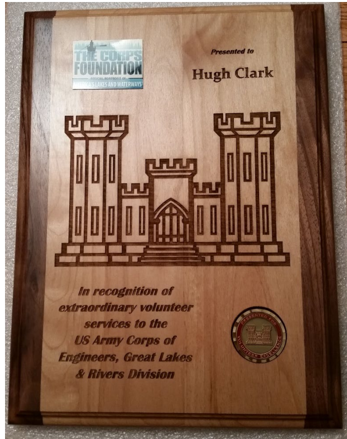
Plaque and ceremony for overall winner, provided by the Corps Foundation