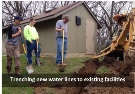
Trenching new water lines to existing facilities