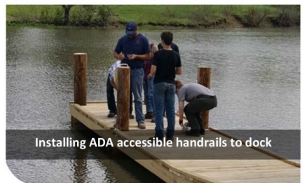
Installing ADA accessible handrails to dock