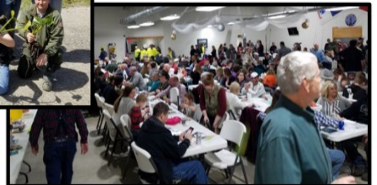
A large crowd of 290 enjoying the first annual Lake Shelbyville Fish Habitat Banquet in February 2019 raising over $20,000.