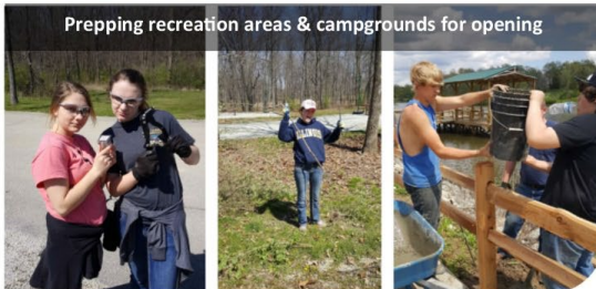
Prepping recreation areas & campgrounds for opening