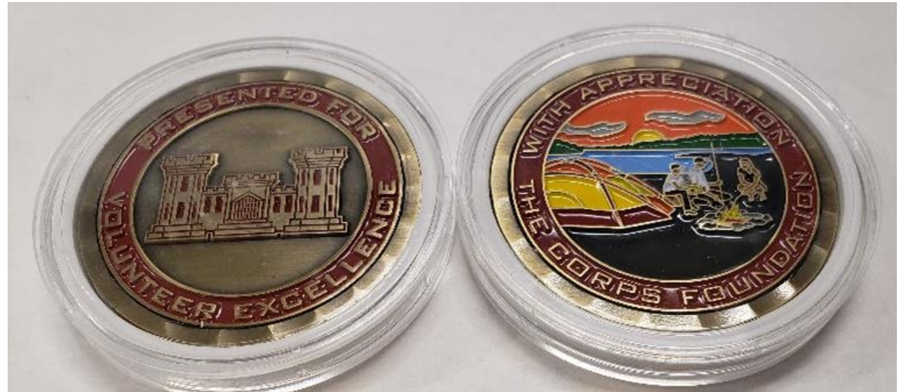
Corps Foundation Volunteer Excellence Coin and certificate for each regional nominee as well as the overall winner