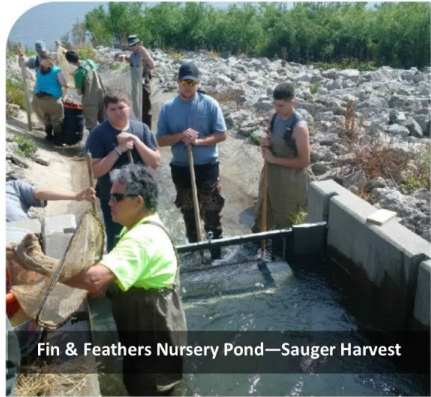
Fin & Feathers Nursery Pond—Sauger Harvest