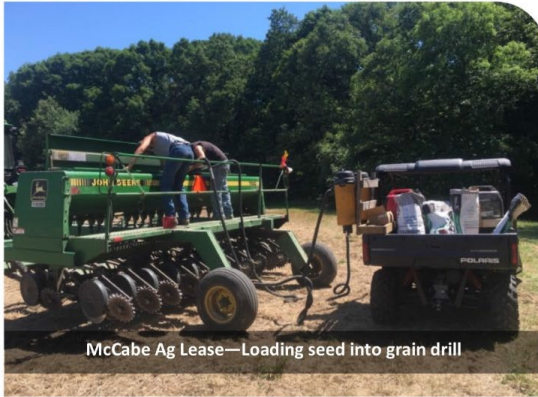
McCabe Ag Lease—Loading seed into grain drill