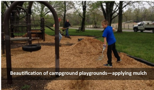
Beautification of campground playgrounds—applying mulch